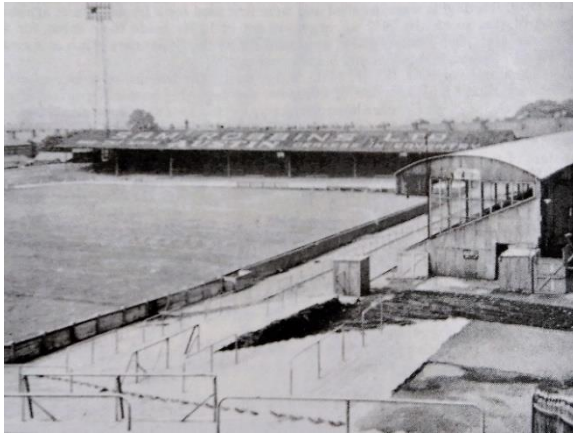
Highfield Road ground in 1963, little changed since 1936

Prior to this in 1910, following a fairly successful season, a new barrel-roofed main stand had been built on the