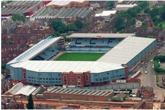
THEN AND NOW: Highfield Road Stadium in its prime (above) and the site now - a green space in the centre of Signet Square (right). See pages 3-4 for an article about the intriguing history of Singers and Coventry City FC.