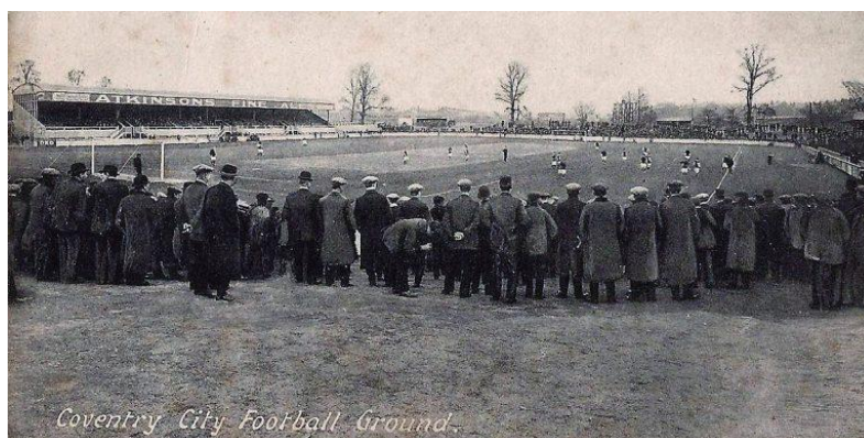
Coventry City Football Ground Postcard view of the early Highfield Road ground in 1912

But this was a period when the city was rapidly expanding and the Stoke Road Ground was soon to be swallowed up by new streets and housing developments. This obliged the club to move to an adjacent plot, slightly to the north, home at the time to the Craven Cricket Club. The new ground was perfectly