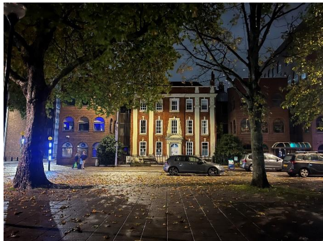
Kirby House at night: crime scene