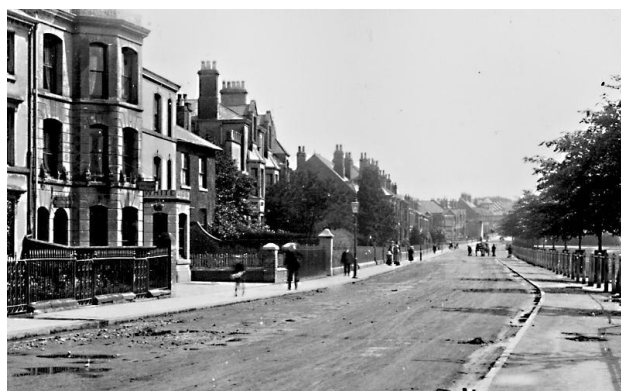
White Lion pub on the left, first home to Singers FC

Singers were formed in 1883 at the Lord Aylesford pub in Hillfields, a popular meeting place for cycle workers at the nearby factory in Canterbury Street. But the club's first headquarters was The White Lion pub at Gosford Terrace, Walsgrave Road, opposite Gosford Green. The pub landlord made a back room available as a players' dressing room, conveniently close to the club's first pitch, Dowell's Field, situated across the Green, off Binley Road.