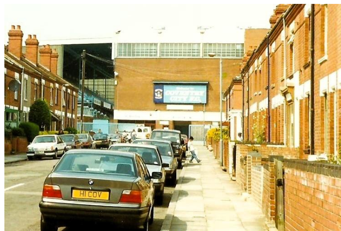
King Richard Street entrance in the 1990s: now a road less travelled

Floodlights were installed in 1953 and by the early 1960s a momentous transformation of the club was underway under the stewardship of Derrick Robins and Jimmy Hill. This prompted a massive programme of ground improvement, beginning in the summer of 1964 with the demolition of the old Thackhall Street stand and its replacement with the Sky Blue Stand, with its spectacular vaulted roofing.