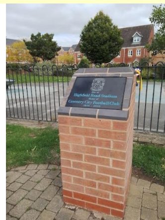
A new plaque in Signet Square

The club started life as the workplace team of Singer's, the cycle manufacturer, and steadily built up a loyal following before changing its name from Singers FC to Coventry City FC in 1898. The next year, 1899, the club acquired the Highfield Road site and they stayed there until 2005 when they moved to what was then called the Ricoh Arena.