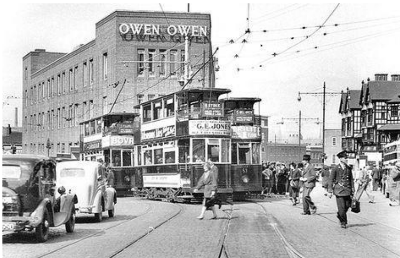
Coventry's first Owen Owen store, opened in 1937 and situated between Trinity Street and Cross Cheaping

Several generations of Coventry folk have taken pleasure in shopping at what was once the city's premier department store – Owen Owen. It originally opened in 1937 but the Coventry store was severely damaged in the Blitz and was later replaced with a new building in post-war Broadgate. But what are the store's origins and why was it called Owen Owen?