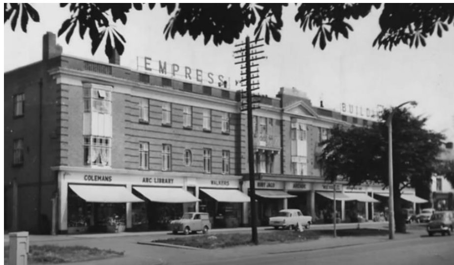
Empress Building in the 1960s

The project involved the demolition of a block of old buildings which had been standing for very many years,