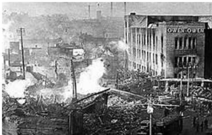
The shattered remains of the Owen Owen store after the Blitz

In 1868, Owen, then aged 20, moved to Liverpool to set up his own drapery business. He leased premises in London Road where he concentrated on rapid turnover and low profit margins. The business expanded rapidly and by 1873 he had over 120 employees and a quarter of an acre of floor space. It is said that he insisted on a high standard of service, and in the early days he himself greeted customers as they entered the store.