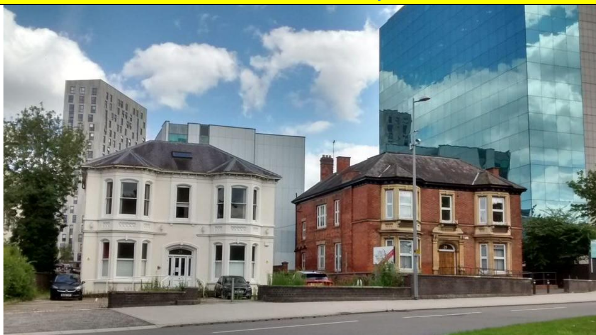
New student accommodation is scheduled to replace these buildings in Warwick Road, opposite Greyfriars Green.