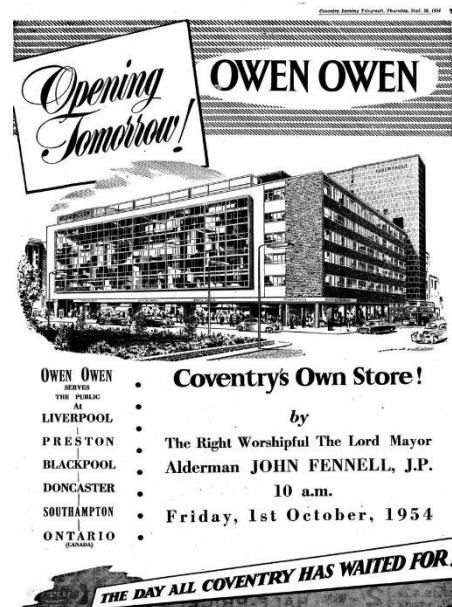
Advertisement in the Coventry Evening Telegraph, 31 st September 1954.

The Coventry store opened in 1937 and was located at the top of the newly-created Trinity Street. War broke out in 1939 and Coventry experienced its first major air raid in October 1940, when the new store was damaged. But the decisive blow arrived during the Blitz on November 14 th when Owen Owen suffered a near-direct hit. The steel-framed outer structure remained intact but the roof was blown off and the interior was reduced to a shell. The store's basement, which housed one of the largest air raid shelters